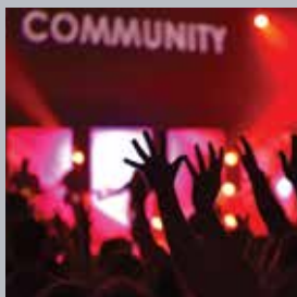
Community events by you