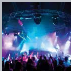
Saturday bands by you