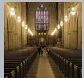
Worship services by you