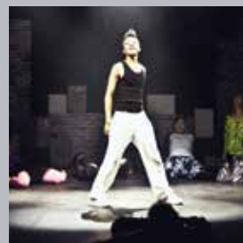
School plays by you