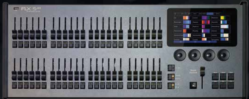
FLX S48 - 96 light fixtures

FLX S consoles are easy to learn and simple to use - delivering all the features you need at an affordable price.