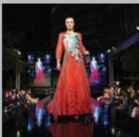
Fashion shows by you