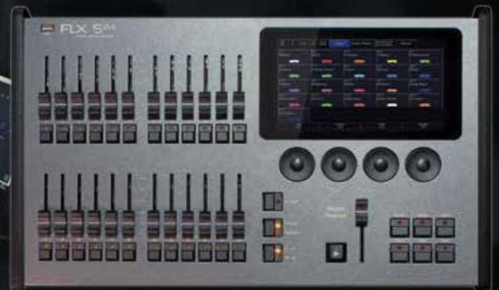
FLX S24 - 48 light fixtures